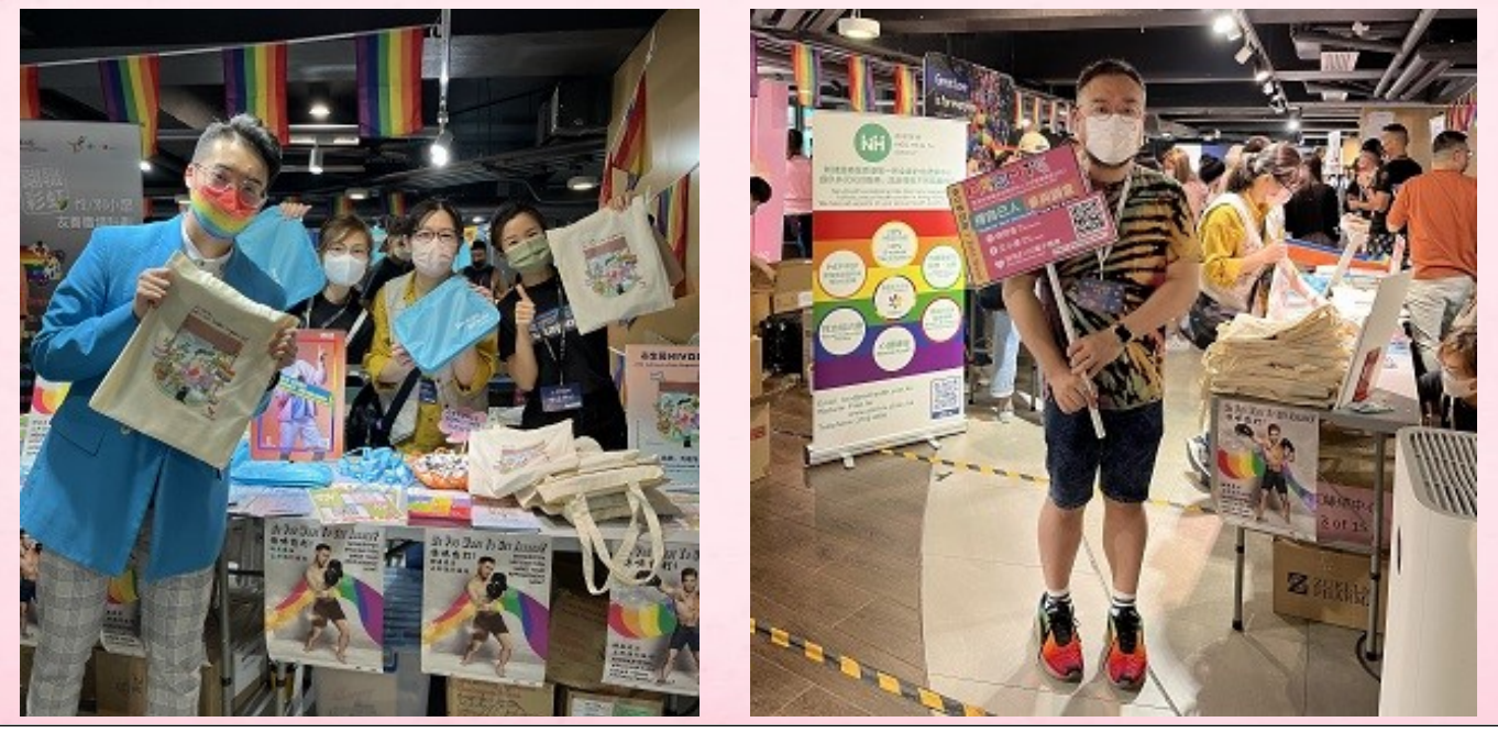
ACA Newsfile Vol 30 Page 6

RRC had hosted a booth at a large-scale LGBT event "Hong Kong Pride Parade 2022" held in the D2 Place One on 13 November 2022 to promote safer sex and HIV self-testing. The event was co-organised by various LGBT community partners. A total of 740 condoms and over 2,000 giveaway items were distributed.