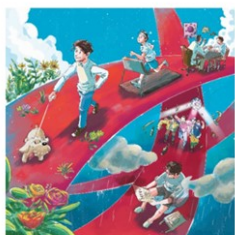
27/11/2021 (WAC ceremony) 【他的理想生活】