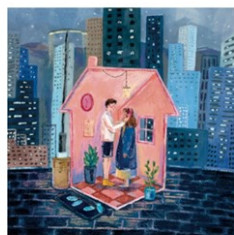
1/12/2021 (WAD) 【兩口子的平凡生活】