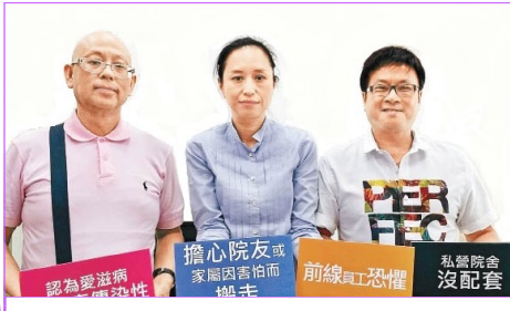
(本報訊) 調查發現，不足 20% 私營安老院願意接收 50 歲或以上的 HIV 感染者