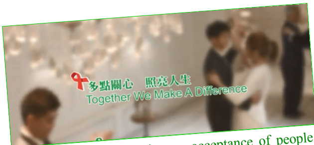
Fig. 8 Public education on acceptance of people living with HIV.