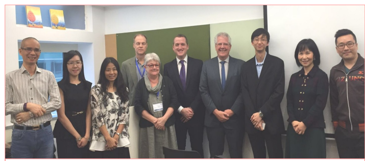
Fig. 15 Seminar held by HKCASO for NGO workers.