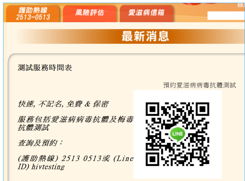
Fig. 4 Launching of online and mobile app booking for HIV testing service.