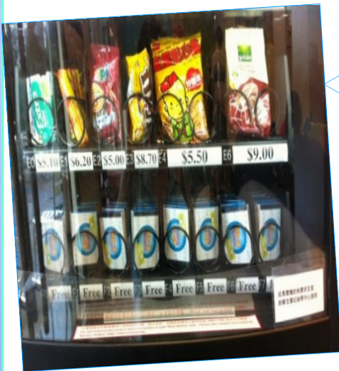
Fig. 1 Distribution of condoms in universities.