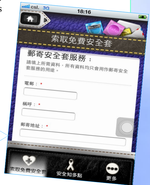
Fig. 2 Provide condom posting services.