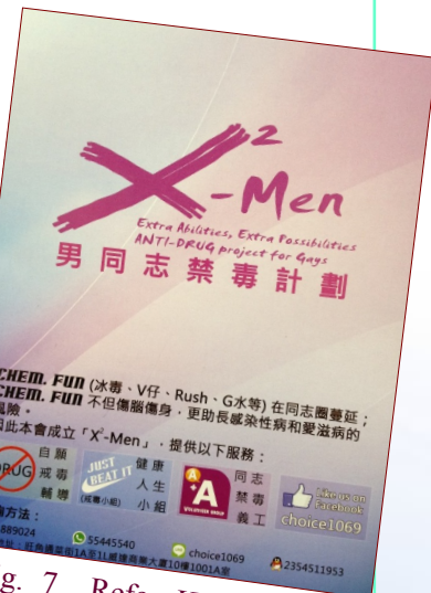
Fig. 7 Refer HIV infected drug users to drug treatment and rehabilitation services.