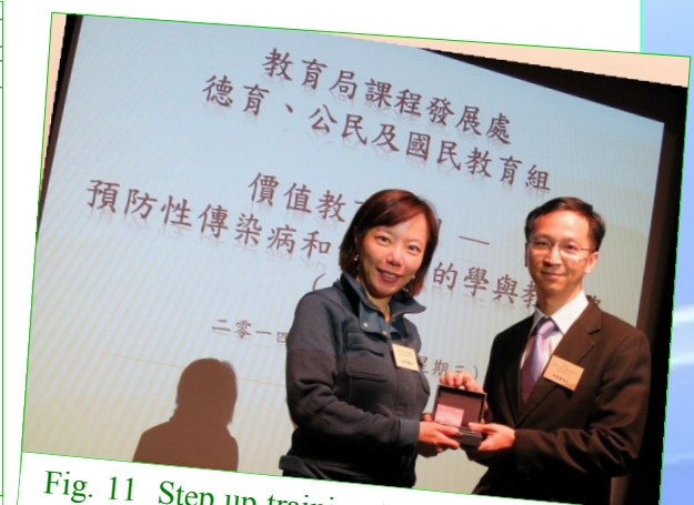
Fig. 11 Step up training to teachers on HIV education.