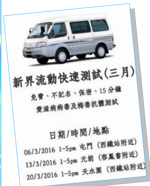
Fig. 3 Mobile testing in remote areas.