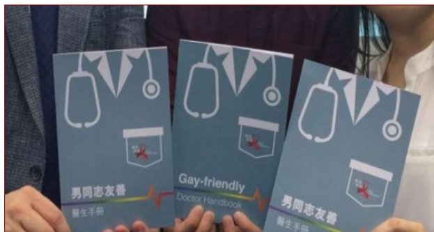
Fig. 6 Training of private doctors to update their knowledge on HIV and sexual health related to MSM.