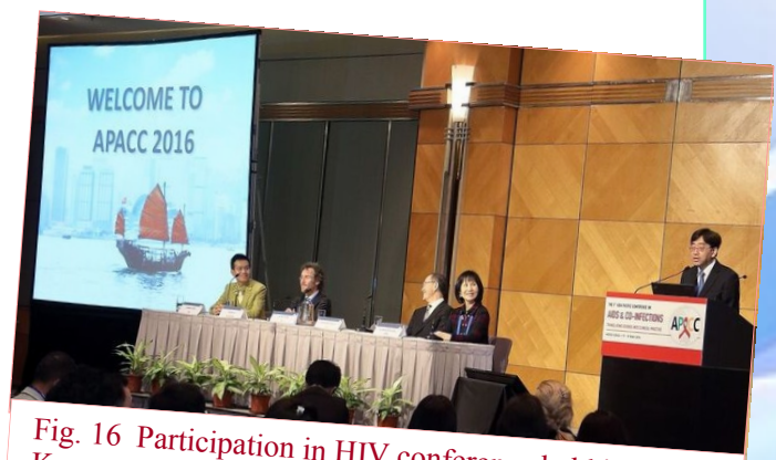
Fig. 16 Participation in HIV conference held in Hong Kong.