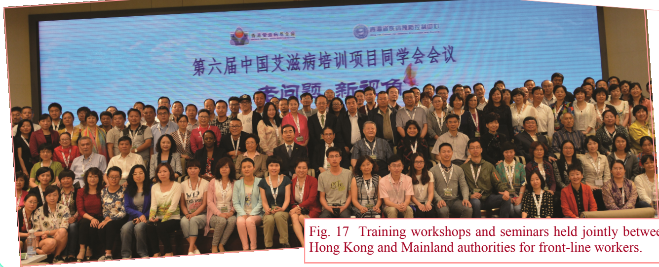
Fig. 17 Training workshops and seminars held jointly between Hong Kong and Mainland authorities for front-line workers.