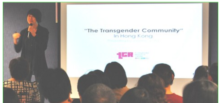
Fig. 9 Training for health care workers of DH and NGOs.