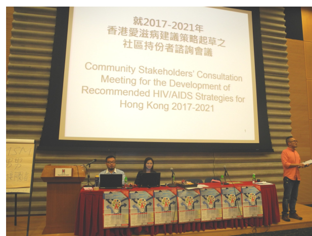
The session of MSM held at the Public Health Laboratory Centre.