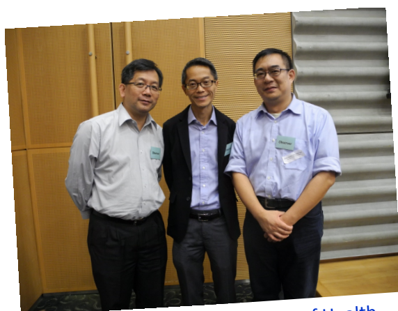
Observers from the Department of Health