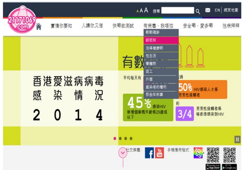
Figure 1 - 21171069.com website homepage

This service has drawn reference from overseas experience in Australia, Netherlands, USA and Canada, which showed that similar services were well accepted by users and cost-effective. Misuse was only reported at an extremely low rate.