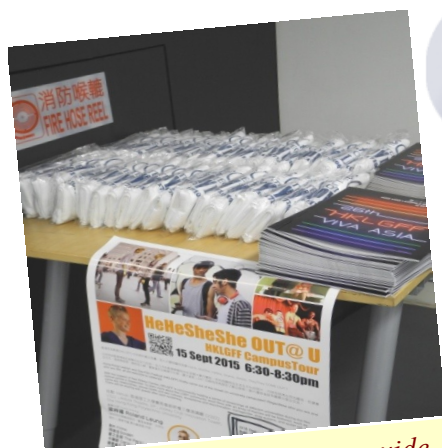
HKLGFF programme guide and souvenirs were distributed to the students.