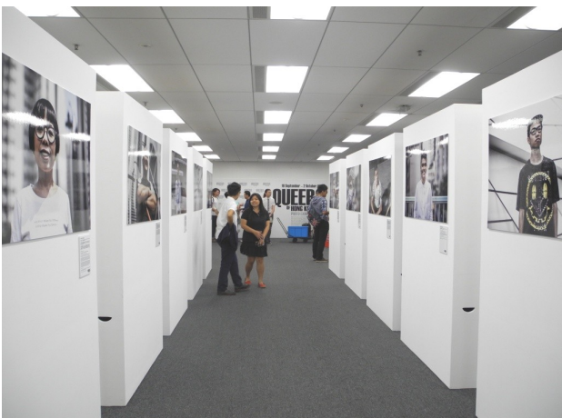
“Queers of Hong Kong” photo exhibition at Department of Sociology, HKU.