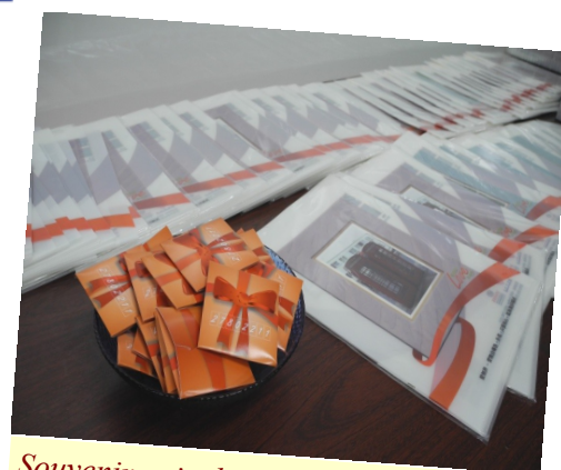
Souvenirs including condoms were distributed.