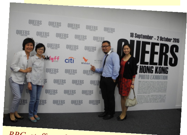
RRC staff at the opening ceremony of the “Queers of Hong Kong” photo exhibition.