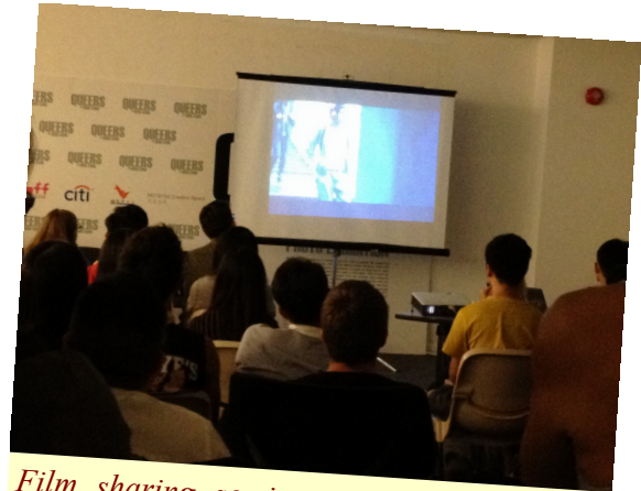
Film sharing session at the University of Hong Kong.

Concurrently there is a photo exhibition “Queers of Hong Kong” by the Department of Sociology of HKU (and it will last until early October). Around 30 photos of LGBTQ people from all walks of life are displayed, each photo with a unique message or story specific to the person. Five photos regarding how the HIV infected patients see their lives are also exhibited.