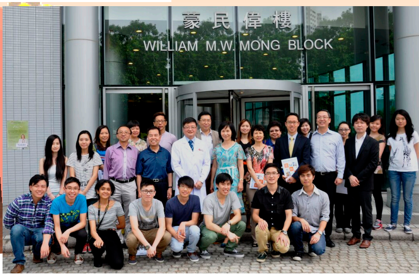
AIDS Institute of The University of Hong Kong