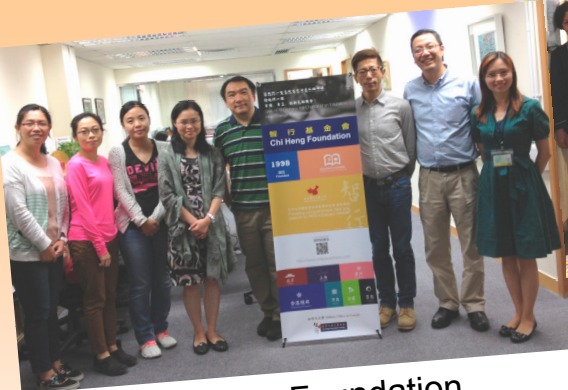
Chi Heng Foundation