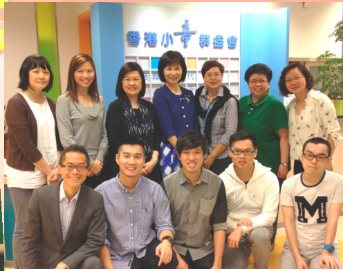
Boys' and Girls' Clubs Association of Hong Kong