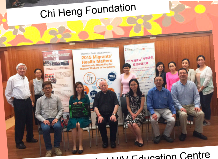
St. John's Cathedral HIV Education Centre