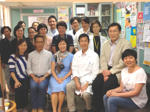
Queen Elizabeth Hospital