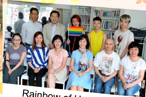
Rainbow of Hong Kong