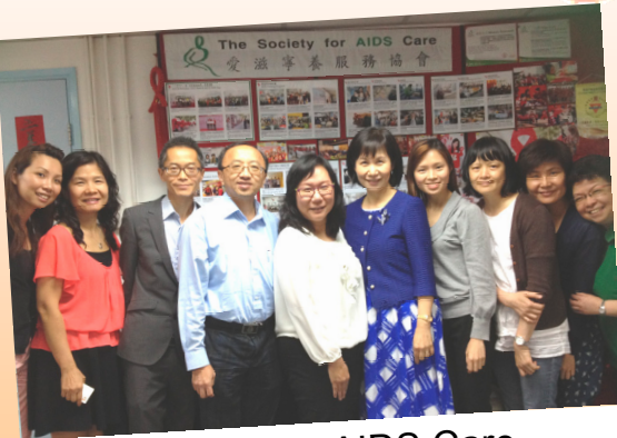
Society for AIDS Care