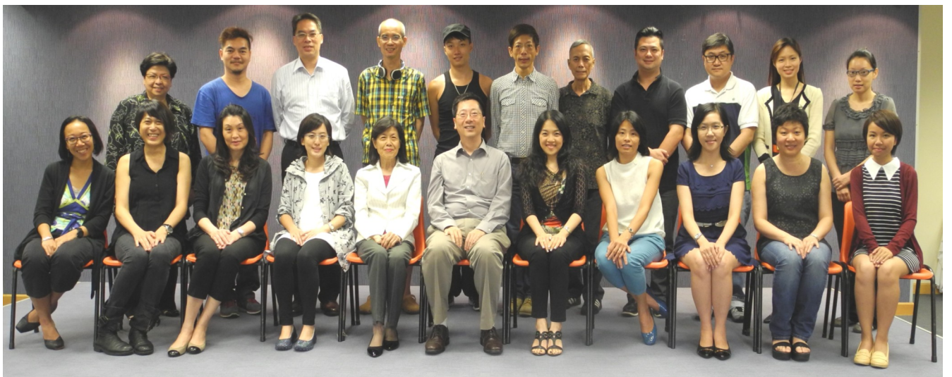
Photo taken during the 33rd CFA Meeting on 11 June 2014