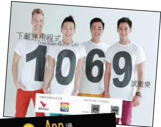
The "1069" mobile app advertisements

MSM remains the highest priority community for HIV prevention. HIV testing and condom use have been promoted through different channels including Gay Film Festival, Hong Kong Gay Pride Parade, gay magazines, gay websites, mobile app, and meetings with representatives from the MSM communities.