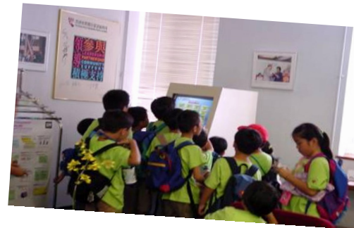
Site visit by students at RRC.

Multiple channels including radio programmes, musical concert, funding of community programmes and site visit at RRC were used to increase the public and student awareness about HIV infection.