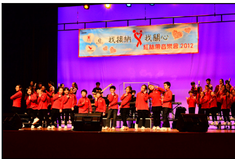
Musical concert at the Hong Kong Baptist University for primary and secondary school students.