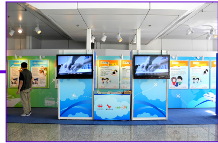
Board exhibition at the Airport in 2012.

Safer sex was promoted to the travellers through board exhibitions, distribution of educational materials and video shows at the Airport and borders including Lok Ma Chau, Shenzhen Bay and China Ferry Terminal.