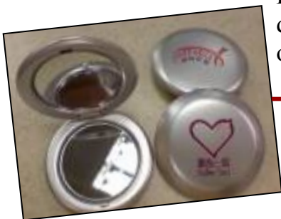
Mirrors distributed to female sex workers promoting use of condom.

Promotion of HIV testing and safer sex was conducted through distribution of souvenirs and condoms by various NGOs during outreach sections and centre-based programmes.