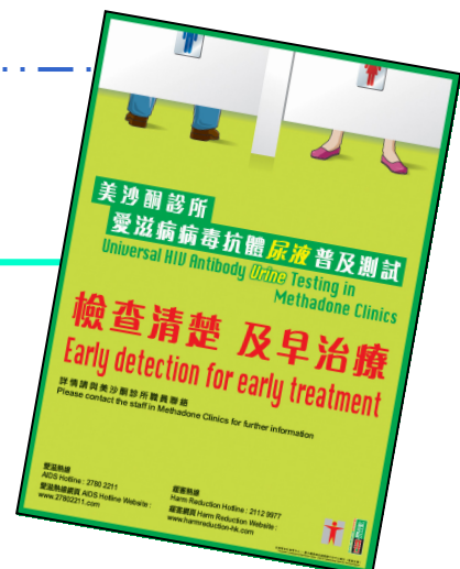
Poster introducing MUT Programme.

Outreach peer education through Phoenix Project and yearly Street Addict Survey were carried out by collaborating with NGO. Early detection of HIV is promoted through Universal HIV Antibody Urine Testing in Methadone Clinic (MUT) Programme.