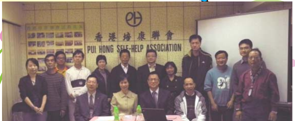
Pui Hong Self-Help Association