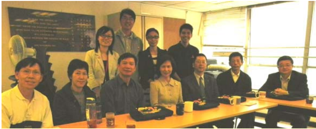
Hong Kong Red Cross