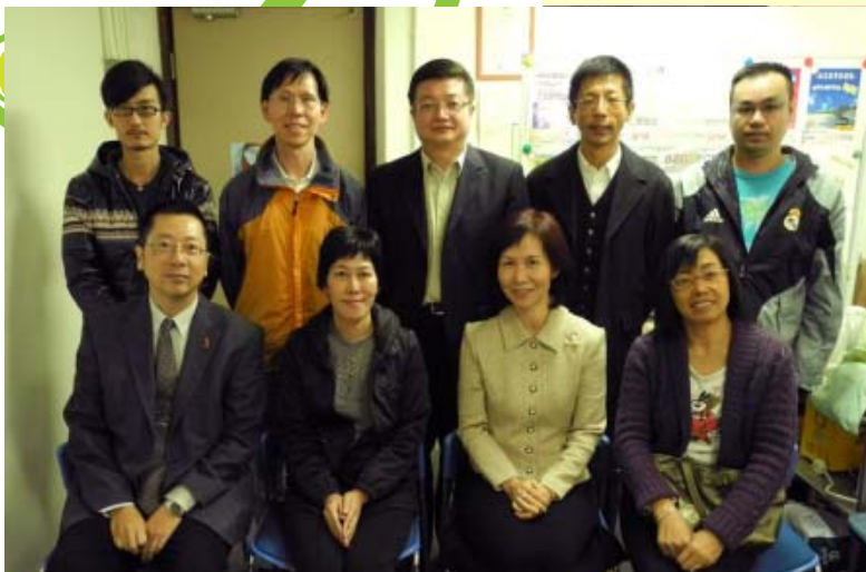
Heart to Heart