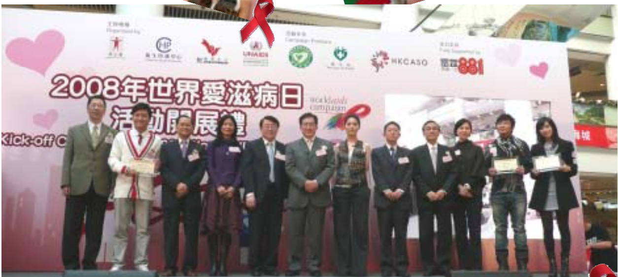
Officiating guests posed for a group photo at the kick-off ceremony