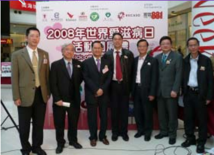
ACA Members attended the ceremony