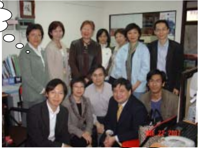
Society for AIDS Care