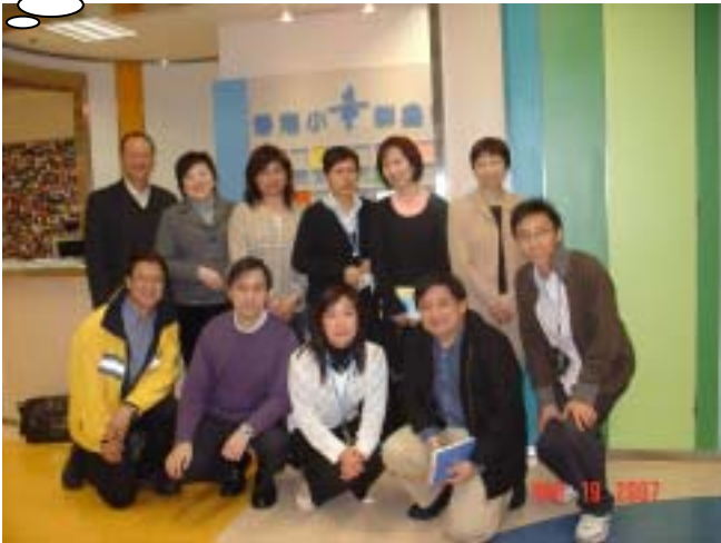
Boys and Girls Club Association