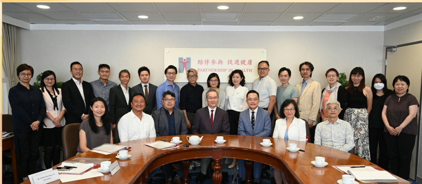
Photo taken during the 123 rd ACA meeting on 14 July 2023