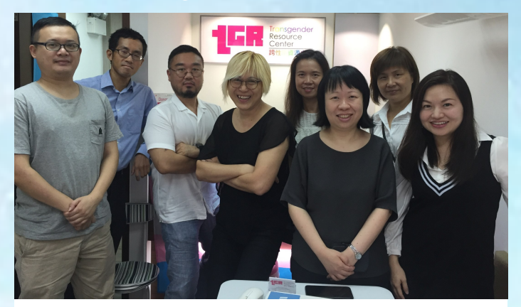
Transgender Resource Center